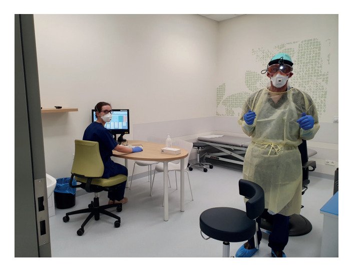
Figure 2. Real-life illustration of the examiner and buddy positioning with personal protective equipment.

pesticide-registration/list-n-disinfectants-useagainst-sars-cov-2. Published 2020).